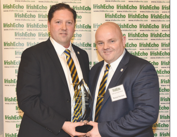
NY Finest Award.