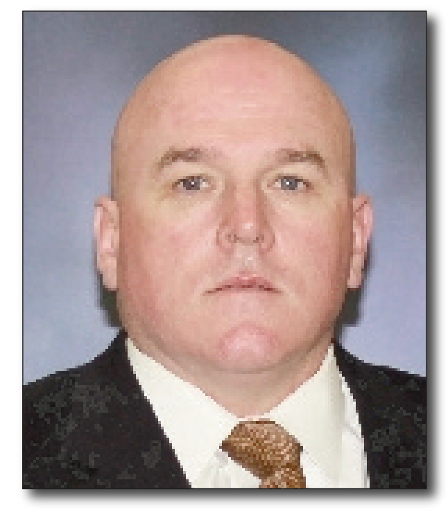
What would people would be surprised to know about me.. .. I'm a scratch golfer who plays down to make those I play with feel better about their game. I love Yacht Rock.

My parents also provided us the opportunity to spend summers with relatives in Ireland in Clifden, Co. Galway and Birr, Co. Offaly.